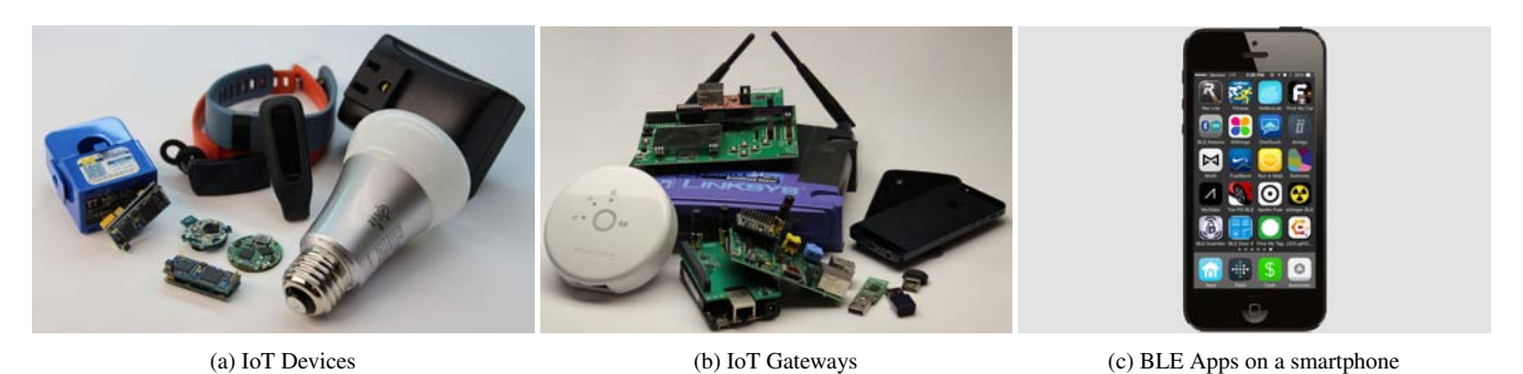
Figure 2: Currently, each of the peripherals in (a) requires its own gateway as shown in (b) and/or an application like those shown on the smartphone in (c) in order to function. Each gateway in (b) and each application in (c) does not support more than a single type of peripheral. Each gateway in (b) connects directly to the Internet through either a computer, Wi-Fi, or wired Ethernet connection.